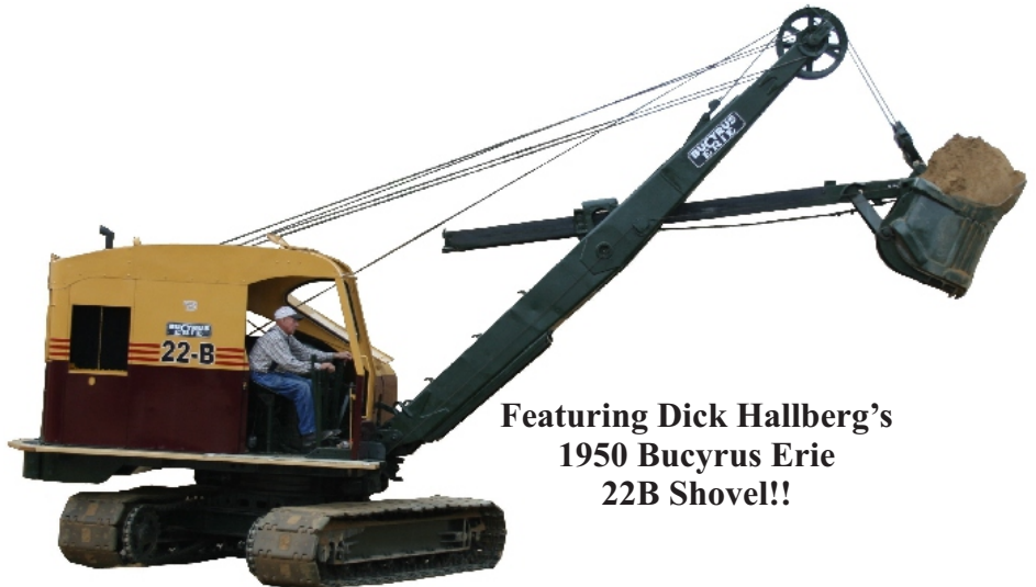
Featuring Dick Hallberg's 1950 Bucyrus Erie 22B Shovel!!

Take exit 15 off I-93 to I-393 east to exit 3, Route 106. Take right on Route 106 and just past traffic light for Route 9, take left into Concord Sand & Gravel/Continental Paving. Follow signs to unloading & parking area. Note: This is a working area for Continental Paving! See map for directions.